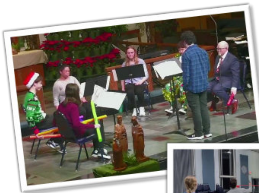
Top: The BoomWhacker Band performs during Family Christmas.

The next issue of the Chimes will be dated January 25 th . Please have any articles submitted to rdanek@waterfordcumc.org by Thursday, January 15 th .