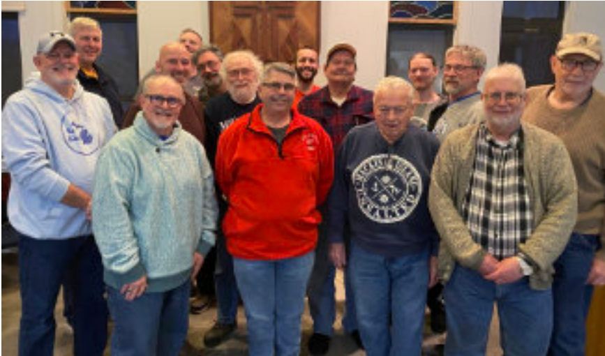
The men of Central enjoyed a weekend of study and fellowship at Skyline Camp & Retreat Center.

several books and developed video classes over her 20-plus-year career. Because of the inclement weather, the trip out to Skyline Camp in Almont, Michigan was a bit harrowing—the 55-minute drive took nearly two hours for some of our participants! Everyone had a great time of fellowship, food, and fun. Next year's Men's Summit will be January 30–February 1, 2026! Plan now to attend.