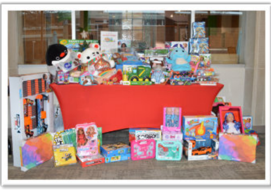
Thank you to everyone who donated toys to the Baldwin Center Holiday Store!