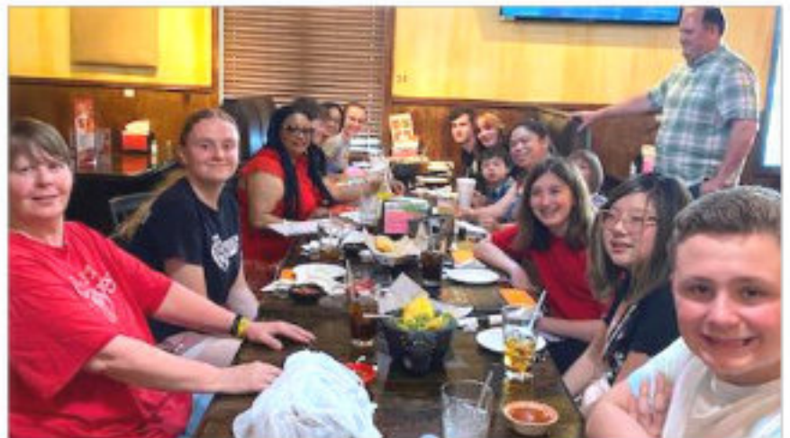
Graduate and end-of-year youth celebration dinner at Don Juan Mexican restaurant.