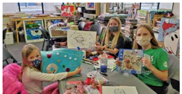
Students of The Art Experience display their work. The Art Experience was Central's designated non-profit for donations made during The Advent Experience.

The Art Experience has provided affordable access to quality art experiences for those of all ages and abilities