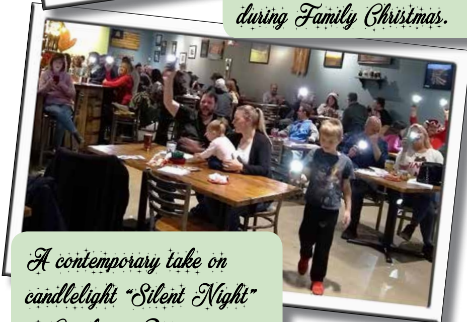
A contemporary take on candlelight "Silent Night" at Carols & Beer.