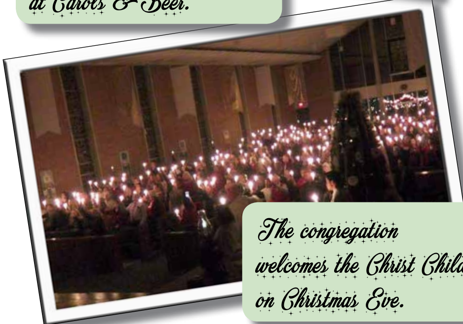
The congregation welcomes the Christ Child on Christmas Eve.