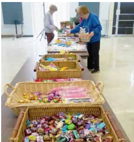
41 Easter baskets were assembled and delivered by the Hutchinson Circle group for children of prisoners. Thank you!

Many volunteers spend countless hours in ministry at Central. If you're a ministry leader, please fill out a Post Event Report so that we can share your good work with your church family. Paper forms can be found in the office, or you can download the form from our website. Just click the word "forms" at the top of the home page, then save the form to your computer. Once filled out, email it to the church office and we'll get the word out about your good work! Thank you.