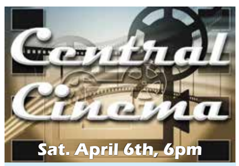
"The Zookeeper's Wife" The true account of the keepers of

Share it with your church family during our Easter Brunch. Sign up outside the office. We're also looking for volunteers to serve and clean up.