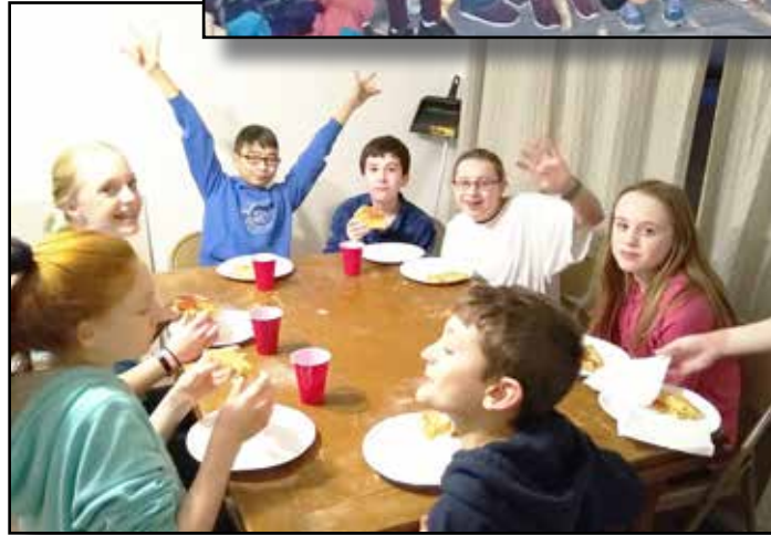
Micah 6 volunteers enjoy social time after an afternoon of washing, sanding, taping and painting walls.