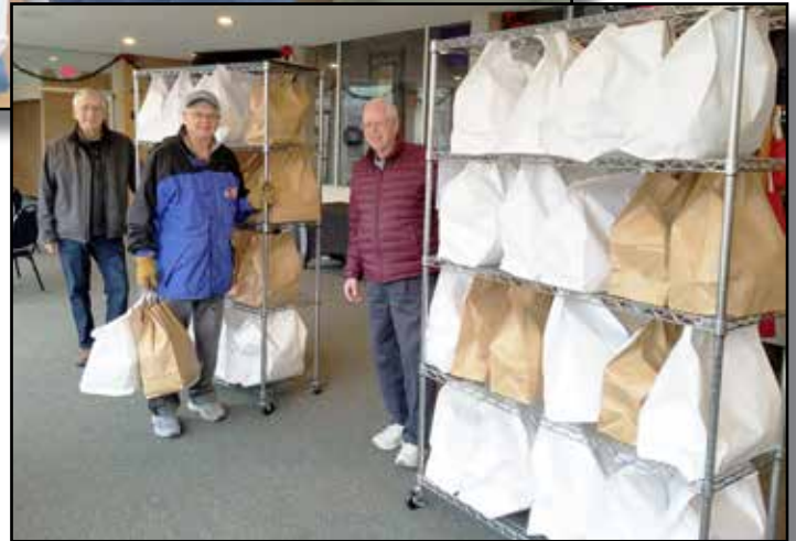
Clothe-a-Child volunteers packing and delivering clothing to local schools.