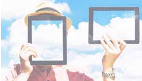
Photo sessions are available September 12th - 14th, 2-9pm and 15th, 10am - 5pm. Sign up on Sunday before/after service or online from the church website.

Sign Up Now! It Won't Be Complete Without You!